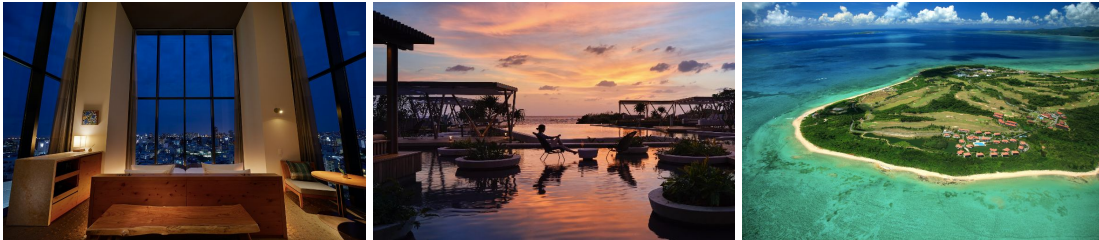
From L-R: HOTEL STRATA NAHA, HOSHINOYA Okinawa, Hoshino Resort RISONARE Kohamajima

FUN FACT... The Okinawan island of Kuroshima in the YaeYama region is not only famous for being the shape of a heart, it's also well known for having more local cows than people!