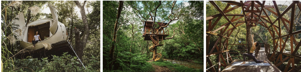
From L-R: Egg treehouse room, wooden treehouse room and 'Floating DNA Catwalk' yoga

September 2020 - Japan's subtropical southern prefecture of Okinawa is set to welcome the opening of a brand new sustainable luxury eco resort in Spring 2021. Designed with the concept of bringing its guests closer to nature, Treeful Treehouse will offer secluded private rooms nestled amongst the jungle canopy alongside a communal Aerohouse space and activities for visitors to explore the local area.