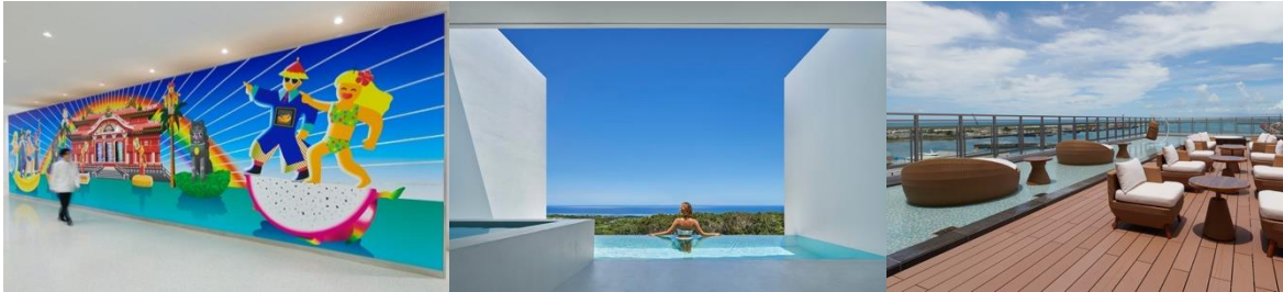
From L-R: CULTURE GATE to JAPAN digital arts exhibition, EMIL NAKIJIN luxury resort, Hotel Third Ishigaki rooftop

FUN FACT... Karate originated in Okinawa and is still widely practiced in the prefecture today!