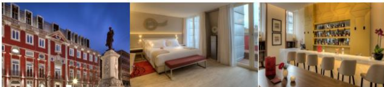
From L-R: façade, room and bar

With its splendid location on the banks of the river Douro and an array of architectural gems, Porto entices couples with its stunning historic centre, sumptuous gastronomy and the world famous vinho do Porto (Port wine).