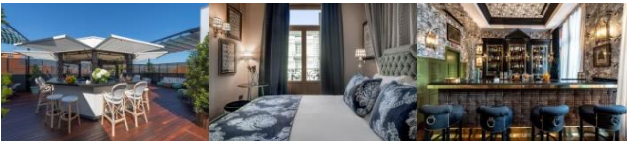
From L-R: Mumus Terrace Sky Bar, room, and bar