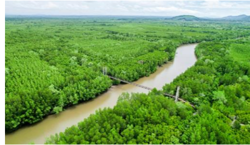
From L-R: The Sarojin's staff planting mangroves, logo of initiative and Bang Phat mangroves forest

September 2022. The Sarojin , Thailand's 56-room independent boutique residence, is launching a "One Booking One Tree" initiative on 1 st October, whereby the resort will commit to planting a minimum of one tree for every booking that is made. With at least one planting day scheduled to take place every month, on which guests will be invited to participate, the resort estimates that thanks to the new initiative and other ongoing projects the resort supports approximately 3,600 trees will be planted in 2022 and forecasts 1,200 trees each month for 2023, 14,400 yearly.