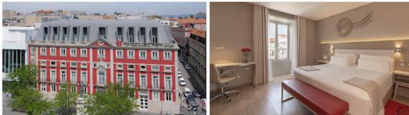
NH Collection Porto Batalha. Download high-res images here

Porto offers a charismatic alternative that is more laid-back and less touristy than Lisbon, the Portuguese capital. Porto's highlights include the sweet red wine that takes the city's name, the cobble streets and ancient buildings of the Ribeira district, and the Douro River, which cuts through dramatic gorges. The city's cuisine of hearty traditional dishes and seafood rivals Lisbon's, and often at more affordable prices.