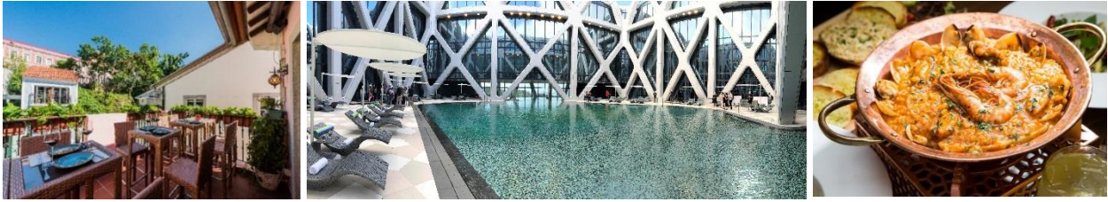
L to R: Tapas de Portugal Rooftop Terrace, Sky Pool at Morpheus and delicious Macanese food at La Famiglia