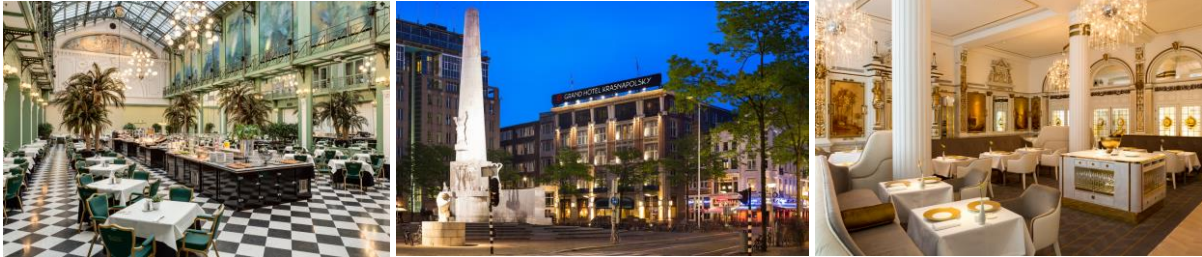
From L-R: NH Collection Amsterdam Grand Hotel Krasnapolsky Winter Garden, exterior and restaurant

Finding tulips in Amsterdam is never difficult in spring, but Easter is often one of the best times of year to visit if you're a fan of the florals. Every April, the city hosts its annual Tulp Festival , when parks, gardens, museums, landmarks, shops and restaurants across Amsterdam exhibit vibrant tulip displays - creating a wash of vivid colour across the city.