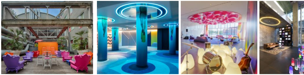
From L-R: nhow Milan, nhow Marseille , nhow Berlin and nhow Rotterdam

At the Group's nhow properties, it's not just the destinations that are full of vibrancy and art